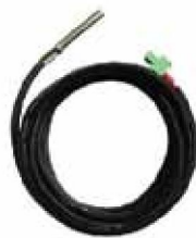
Remote temperature sensor RTS300R47K3.81A