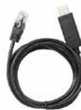
PC communication cable CC-USB-RS485-150U