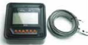
Remote meter MT50